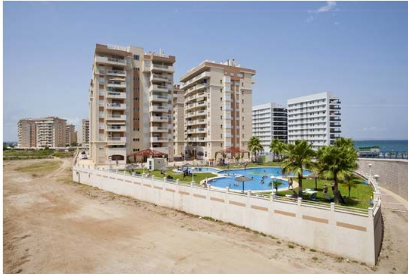
La Manga Spain